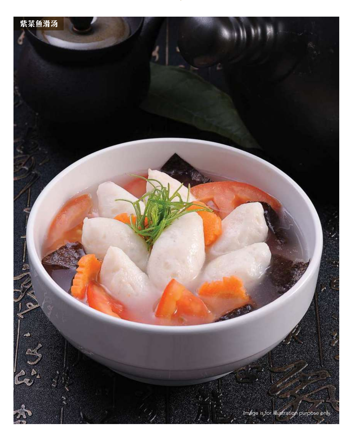
紫菜鱼滑汤 Double Boiled Seaweed Soup with Fish Paste RM20 (小) RM30 (中) RM40 (大)