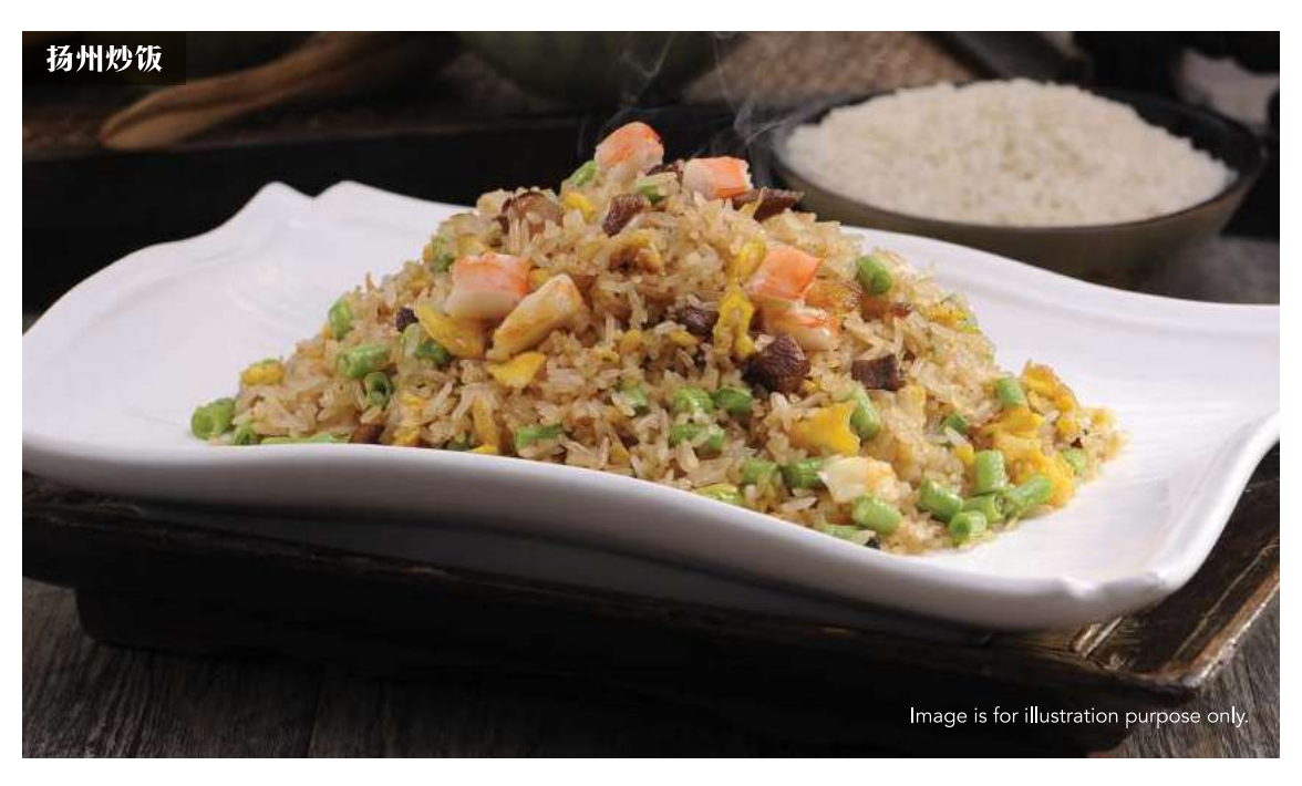
扬州炒饭 Yong Zhou Fried Rice