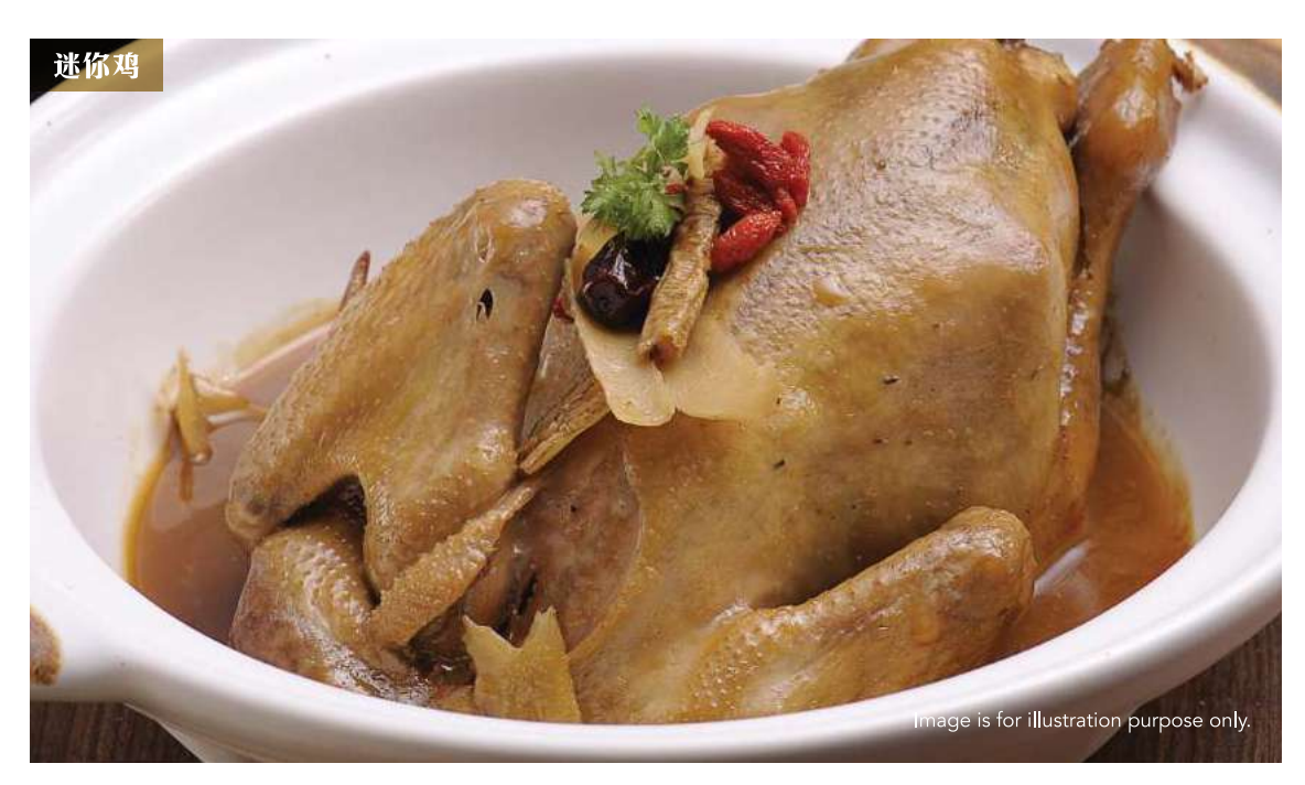
迷你鸡 Mini Herbs Chicken