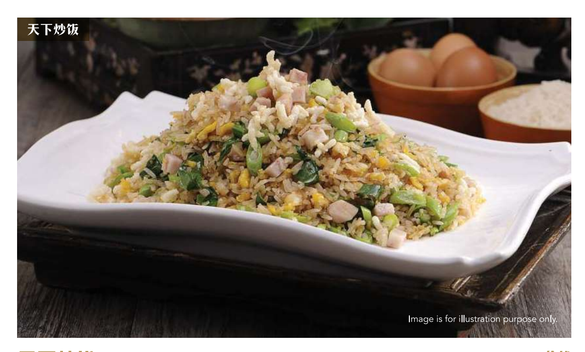
天下炒饭 Oversea Premium Fried Rice