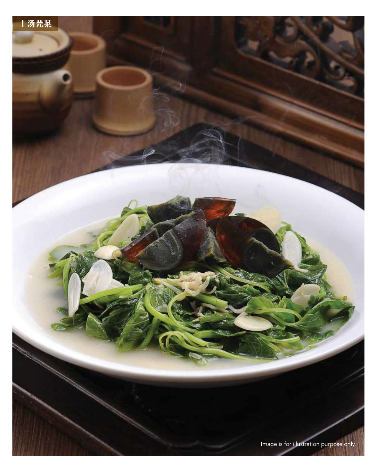
上汤芫菜 Par Boiled Armanath