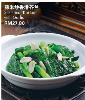
蒜米炒香港芥兰 Stir Fried 'Kai Lan' with Garlic RM27.80