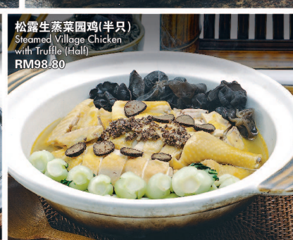
松露生蒸菜园鸡(半只) Steamed Village Chicken with Truffle (trial) RM98.80