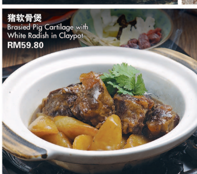
猪软骨煲 Braised Pig Cartilage with White Radish in Claypot RM59.80