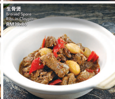
生骨煲 Braised Spare Ribs in Claypot RM38.80