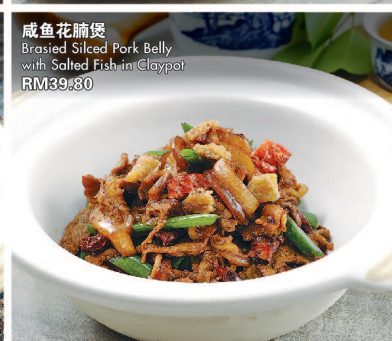
咸鱼花腩煲 Braised Silced Pork Belly with Salted Fish in Claypot RM39.80