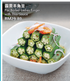
霹雳羊角豆 Par Boiled Ladies Finger with Thai Sauce RM29.80