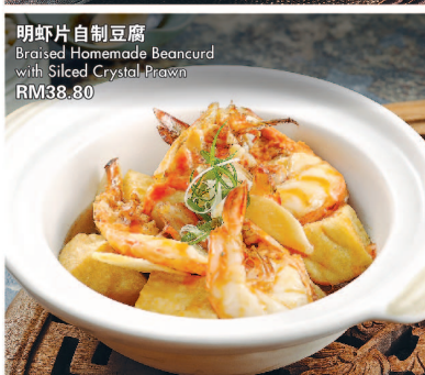
明虾片自制豆腐 Braised Homemade Beancurd with Sliced Crystal Prawn RM38.80