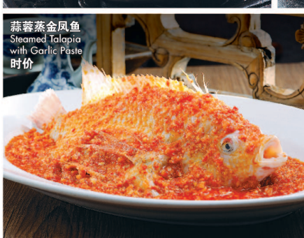
蒜蓉蒸金凤 Steamed Talapia with Garlic Paste 时价