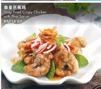
泰皇芭蕉鸡 Deep Fried Crispy Chicken with Thai Sauce RM34.80