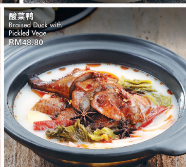
酸菜鸭 Braised Duck with Pickled Vege RM48.80