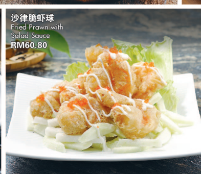
沙律脆虾球 Fried Prawn with Salad Sauce RM60.80