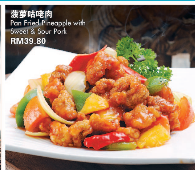
菠萝咕咾肉 Pan Fried Pineapple with Sweet & Sour Pork RM39.80