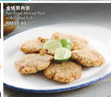
金钱煎肉饼 Pan Fried Mince Pork with Salted Fish RM38.80