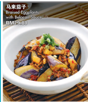
马来茄子 Braised Eggplants with Belacan Sauce RM29.80