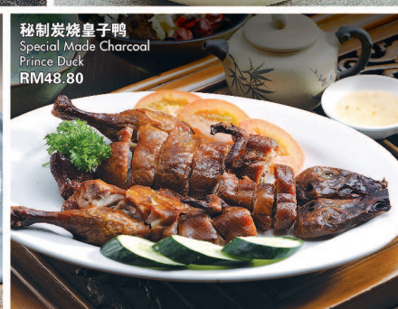
秘制炭烧皇子鸭 Special Made Charcoal Prince Duck RM48.80