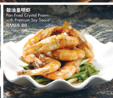
鼓油皇明虾 Pan Fried Crystal Prawn with Premium Soy Sauce RM69.80